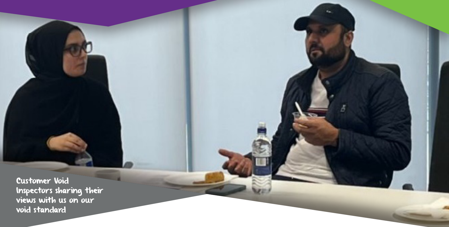
Customer Void Inspectors sharing their views with us on our void standard